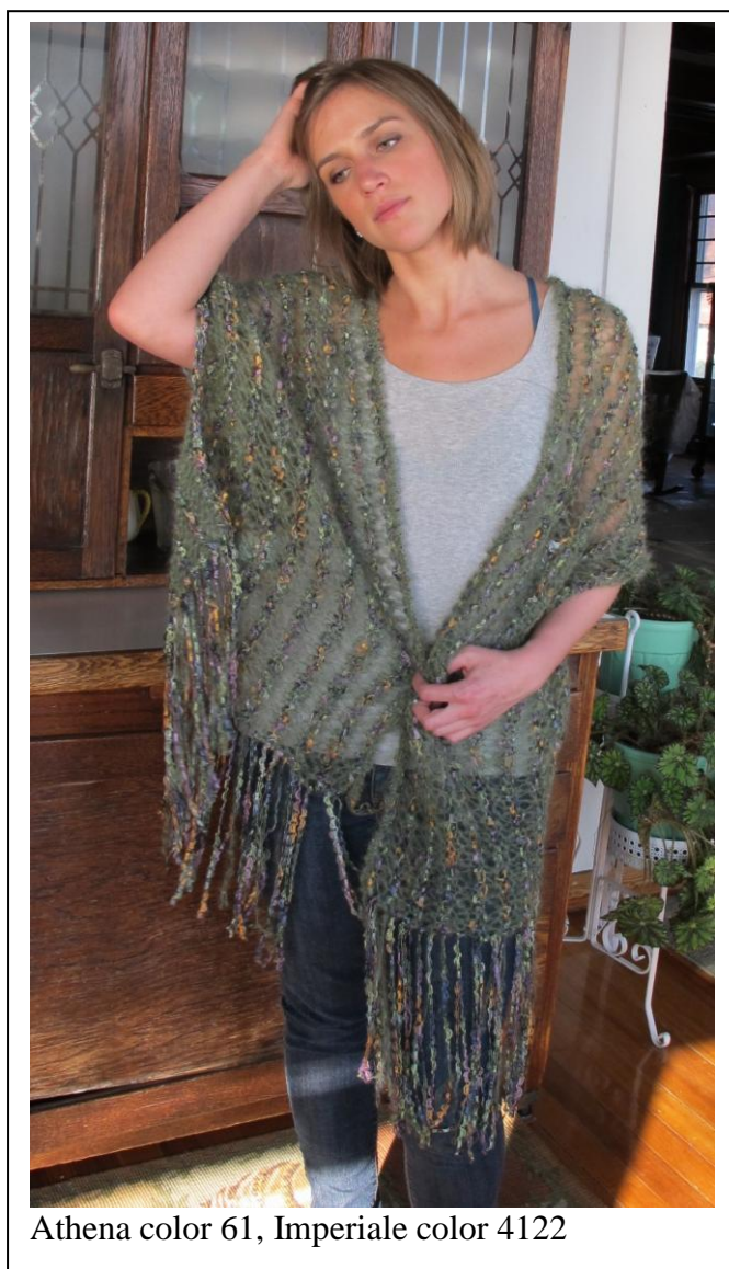
Athena color 61, Imperiale color 4122