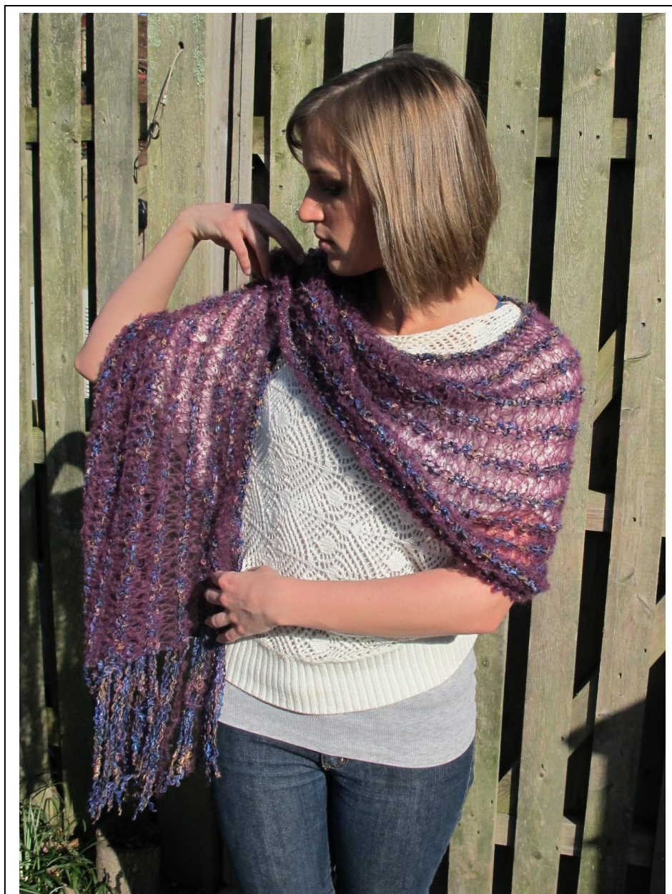
Athena color 68, Imperiale color 4120